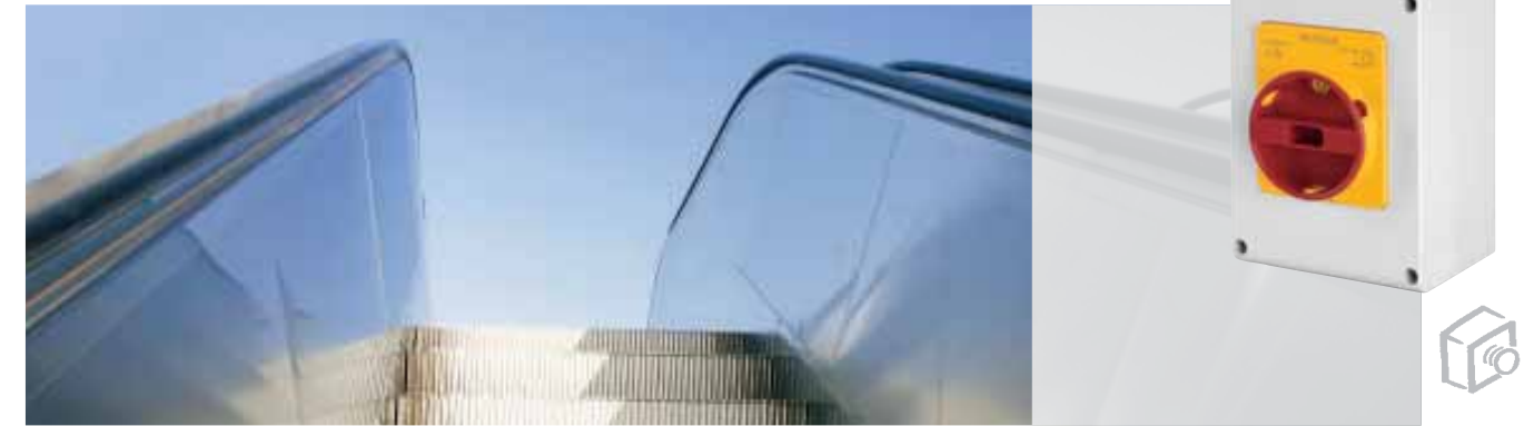
1.4 Switch disconnectors..... page 162