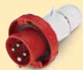
OPTIMA Series Industrial plugs and sockets ..... from page 40