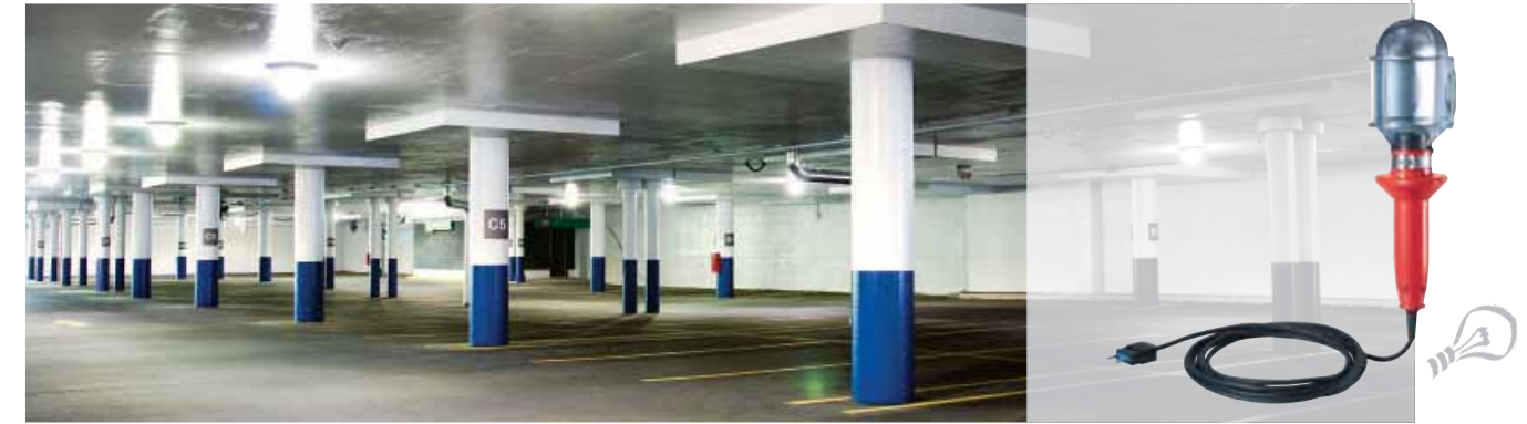
1.5 Light fittings..... page 178