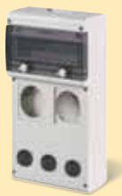
BLOCK Series Surface mounting enclosure IP66 ..... from page 118