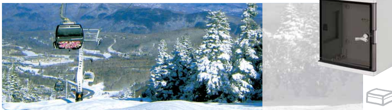
1.3 Enclosures for electrical equipment in thermoplastic material..... page 104