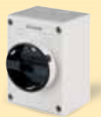
ISOLATORS Series Single pole switch ..... from page 168