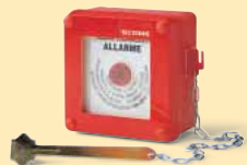
EMERGENCY Series Emergency call points ..... from page 130