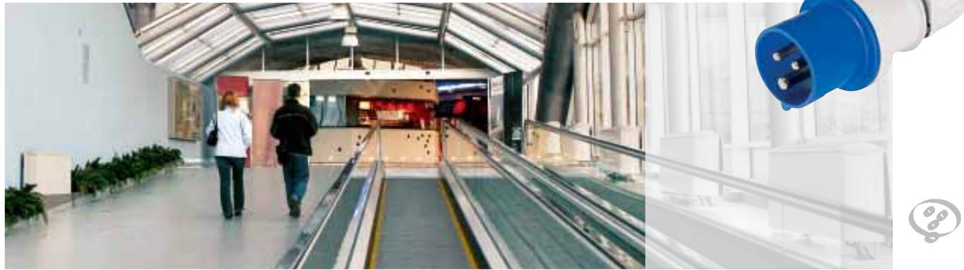
1.1 Plugs and sockets for industrial applications..... page 32