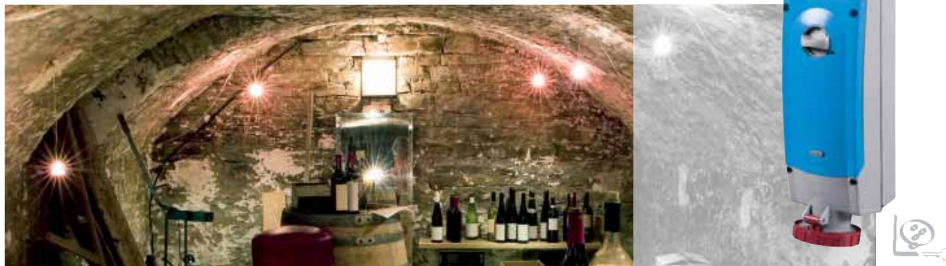
1.2 Interlocked switch socket outlets..... page 76